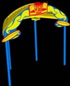
HALF HEX ROOF